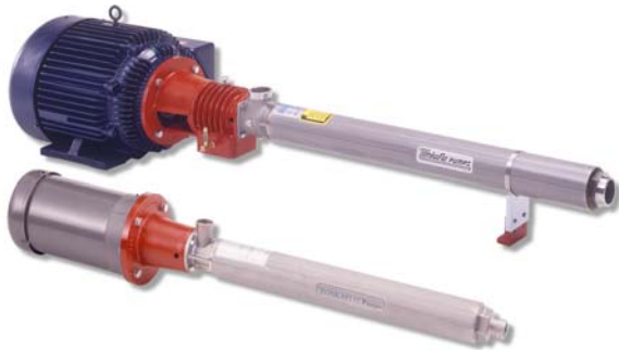
Figure 1: Tonkaflo SS Series pumps

As the industry standard for reverse osmosis (RO), Tonkaflo SS Series pumps (Figure 1) are backed by years of proven experience. The SS Series is a stainless steel multi-stage centrifugal pump with Noryl* plastic impellers. To reduce pump wear, SS Series pumps operate at lower speeds than single-stage pumps while achieving equivalent boost pressures. The SS Series' flexible, multi-stage design allows users to achieve their exact pressure requirements by adding or removing stages.